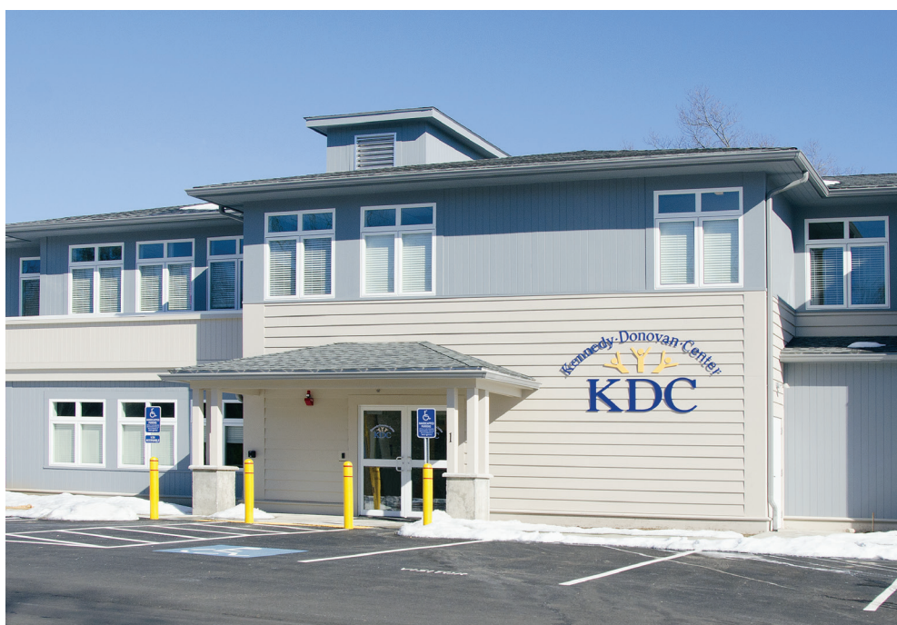
Our new Foxboro administration offices at One Commercial Street.

Over the last decade, KDC has experienced over 15% growth in programs, services and support staff. We simply outgrew the old building which served as home since 1991, and renovation simply would not have met current or future needs. Our new facility accommodates existing staff and will allow for future growth so we can continue to focus on our mission of providing services that are individualized, compassionate, and innovative.