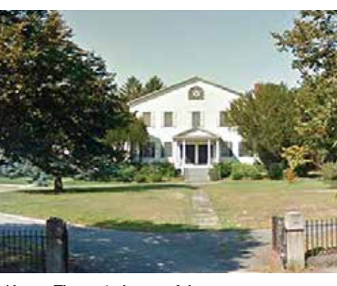
Above: The main house of the new property on County Street. Below: Architectural rendering of KDC's new program center.

A long time in the works, the acquisition our organization as well as to the growing New Bedford community.