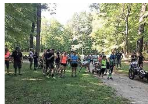
Photo: Start of the Fun Run with participants of all ages and abilities.

KDC's South Central Early Intervention program hosted their annual event on August 27th at the Westville Dam Recreation area. Special thanks to our sponsors for a great event: Southbridge Savings Bank, Schott North America, United Lens, Southbridge Tool, Team Hoyt Running Chairs, Hemlock Landscaping, Rotary Club of Southbridge, and Webster Five Cents Savings Bank.