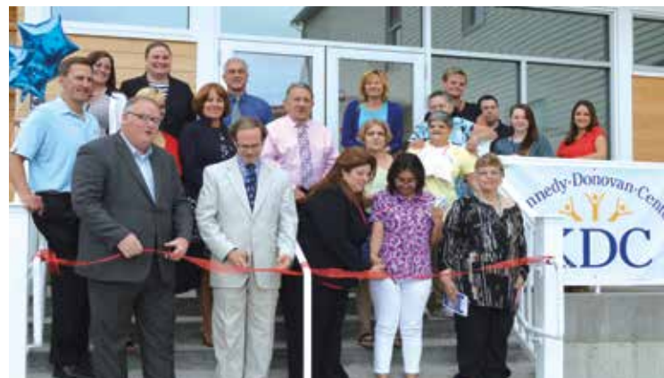
Donors, board members, community representatives, staff members, and individuals we serve at the ribbon- cutting ceremony.