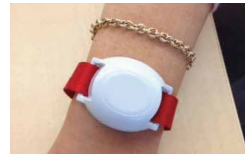
SafetyNet tracking unit by LoJack helps locate those who wander or become lost.

Support from the Ida Ballou Littlefield Trust in the amount of $2,500 helped us to reach the milestone of raising 90% of our capital campaign goal. Our Building a Better Future capital campaign is raising funds for the renovation of property located at 385 County Street, New Bedford. The renovation of this historic property and the associated campaign are a multi-year effort. More information can be found on our website.