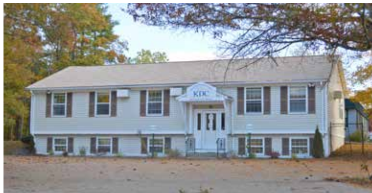
Original Administrative Offices building

Kennedy-Donovan Center's administrative office is operating in a temporary location at 33 Commercial Street, Foxboro, during the demolition and rebuilding of its new home at One Commercial Street. In February, the building was razed and the lot cleared. Several employees watched while the excavator tore down and crushed the old building. It certainly was a bittersweet moment for those with a long tenure at KDC.